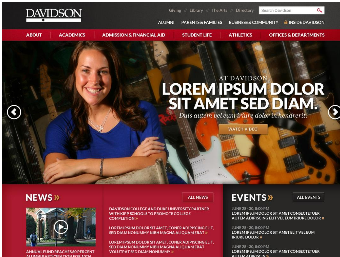
Exhibit 3. Davidson College’s new website design, commissioned from BerkelyREI.